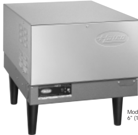
Model C-24 on 6" (15 cm) legs