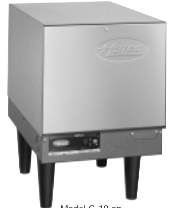
Model C-18 on 6" (15 cm) legs